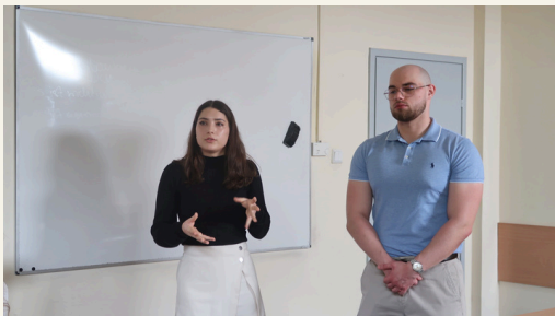
Presenters from Poland