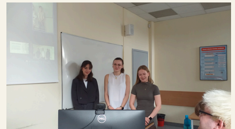
Presenters from Poland