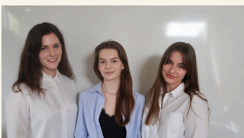
Presenters from Poland