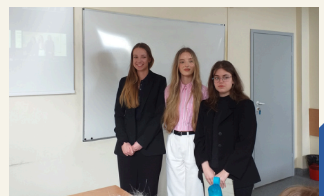
Presenters from Poland