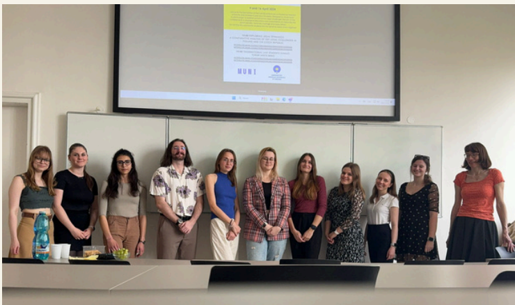
Presenters from Masaryk University

International Student Conference was the second edition of the hybrid conference, co-hosted by Masaryk University and Nicolaus Copernicus University.