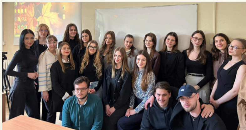
Presenters from Nicolaus Copernicus University

The conference was aimed to explore legal dynamics through opening the debate. As a result, over 70 students of II year law faculty from Czech and Poland gave their voice to current legal challenges, including human rights such as abortion, same-sex marriage, as well as criminal law areas: death penalty, multi-recidivism and many others!