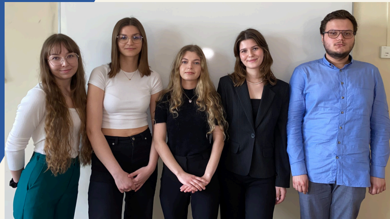
Presenters from Poland in Room A

The first conference day began with an impactful insight into the history of the death penalty's abolition in Conference Room A. Meanwhile, students in Conference Room B explored the effectiveness of support systems for child sexual abuse in Poland and Czech Republic